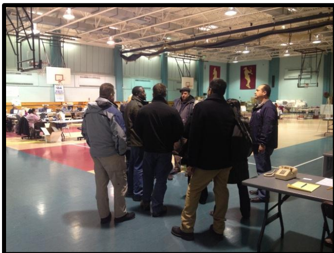
Representatives from city of Chicago, IEMA and FEMA toured areas of New York that were impacted by Hurricane Sandy as well as received briefings from responders that included lessons learned.

A disaster in a large urban area brings complex issues and challenges that FEMA, state and local officials don't often face. Hurricane Sandy brought these issues to the forefront, and provided an opportunity for Chicago and Illinois state officials to gather lessons learned in preparation for a similar disaster within Region V.