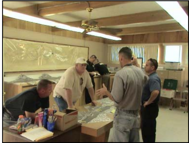
Above: The Command Center fairly early into the Sny Island Levee operations. Below: Aerial of the June 25th levee building efforts in Hamburg.

Teams were deployed initially to those counties along the river declared a State Disaster but ultimately declared a Federal Disaster. Those counties included Quincy, Mercer, Henderson and Rock Island Counties with a team sent to the SEOC as well.