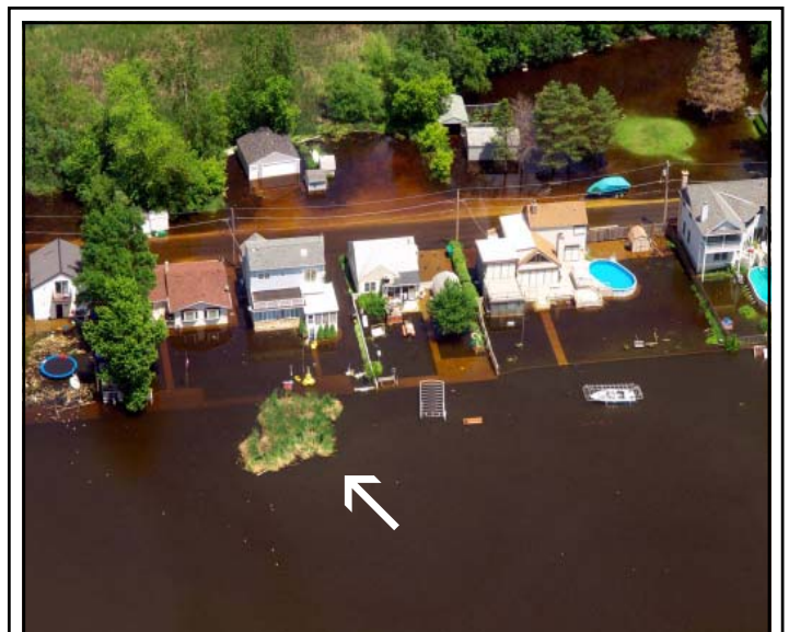
Pieces of a wetland/bog broke off from the Grass Lake shoreline on the Chain O'Lakes during the flooding on the Fox River in Lake County. One "floating island" was originally about 12 acres in size until it broke into three smaller chunks (above). The floating chunks were pulled back to the shore via boats and staked down to hopefully re-establish themselves to the eroding shoreline.