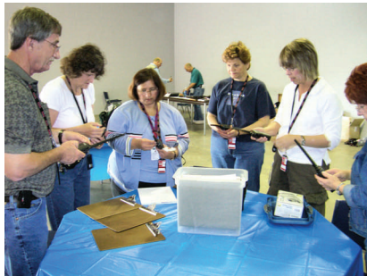
Team members at FLUEX in May 2006.

Team member requirements are posted on the IESMA website and applications are accepted at all times throughout the year.