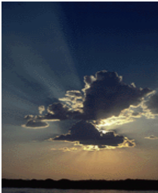
IESMA - working toward a comprehensive plan for the benefit of every jurisdiction within the State of Illinois.

The Comprehensive Volunteer Management Program (CVMP) started in 2007 due to the number of requests from communities regarding overall support for EMA volunteer programs. The CVMP offers support to communities in developing and maintaining local EMA/ESDA volunteers.